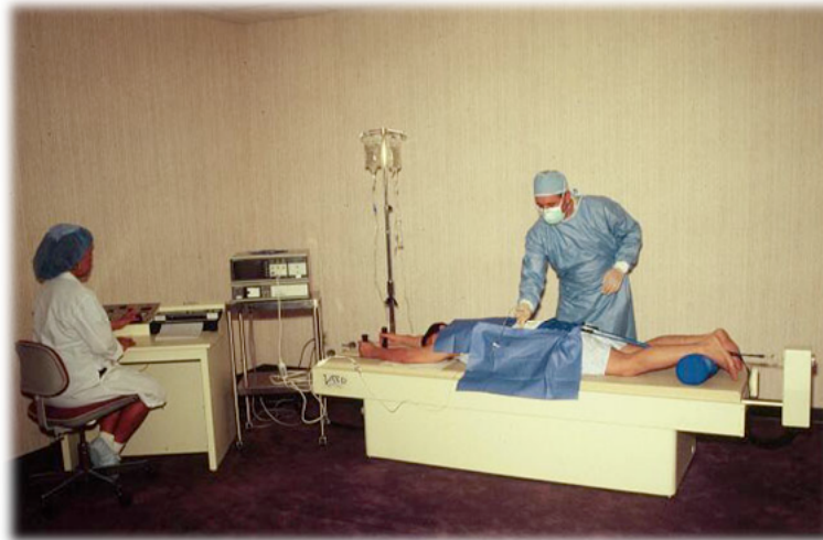
Fig. 1. Photograph illustrating the equipment and the position of the patient as the system is activated. The caudal end of the Table extends, applying tension to the pelvic belt. Upper body movement is restrained by having the patient grasp the handgrips. A graph of the tension applied is plotted by a chart recorder on the control console and the intradiscal pressure readings are entered on the same graph at the apex of each distraction curve.

The patient was prepared and a cannula was inserted under local anesthesia into the nucleus pulposus of the L4-5 intervertebral disc, using anteroposterior and lateral fluoroscopy to position the end. With the cannula in place, the patient was moved to a VAX-D table. The VAX-D equipment* is routinely utilized in our non-surgical treatment program for patients suffering from low-back pain. The equipment consists of a split table design with a tensionometer mounted on the caudal, moveable section. The patient lies in a prone position and grasps handgrips to restrain movement of the upper body, which is supported on the fixed section of the table (Fig. 1 ).